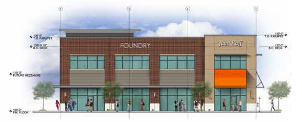
South Elevation – Retail Building B (view from 7th Street)